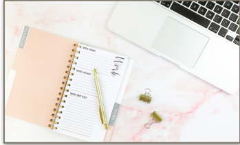
What's On This Summer? Page 4