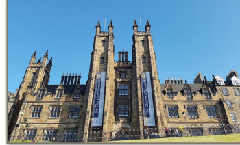
General Assembly 2019 Page 6