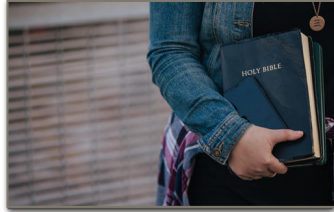
My Story of Faith Page 14