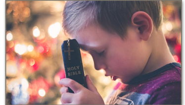
Faith Hacking: Prayer Page 13