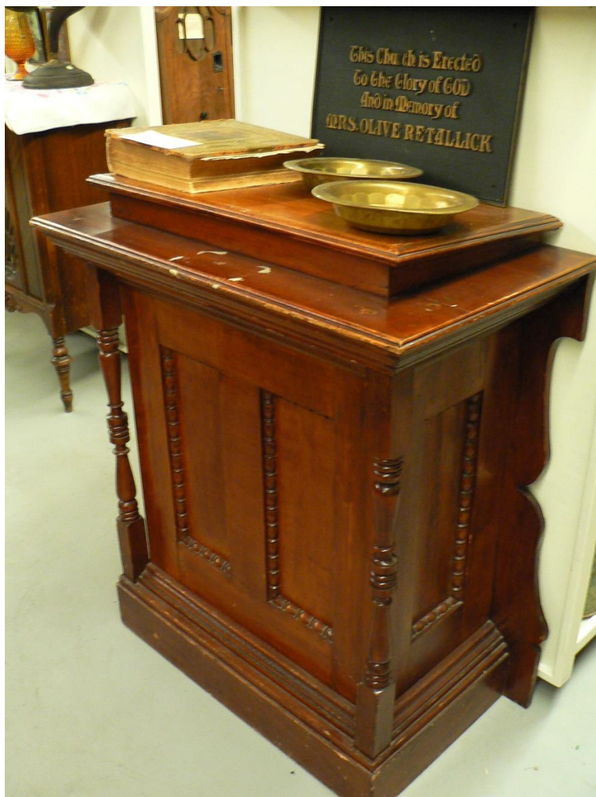
(The pulpit, pulpit Bible, and offering plates from the Methodist Church are located in the Chewelah Museum.)