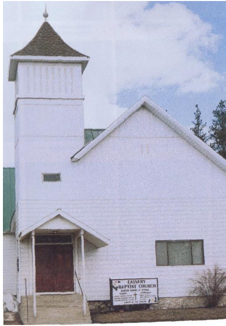
Calvary Baptist Church in 1996

Calvary Baptist Church of Chewelah was formed when a sizeable group of people (33) who had been driving to Colville decided it was time for a church closer to home. First Baptist Church of Colville agreed and Calvary Baptist Church was born.