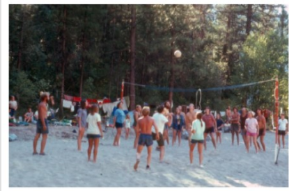
Camping with Volleyball