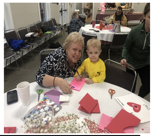
Join us for another fun Church-Wide Activity & Dinner on March 10!