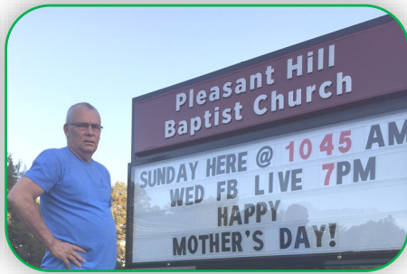
May 10th Mother's Day Service