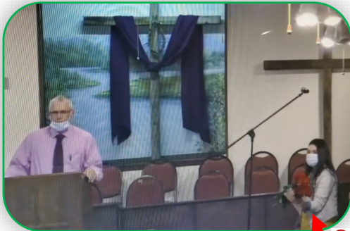
Red Roses for Mother's Day