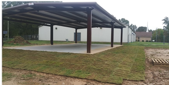
Pavilion with the sod laid around slab. There were 12 guys here to help lay it.