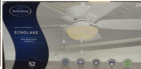
This is one of the fans that will be installed in the Sanctuary very soon. There are 11 total.