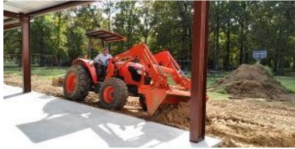
Todd Underwood spreading dirt around the Pavilion getting ready for the Sod