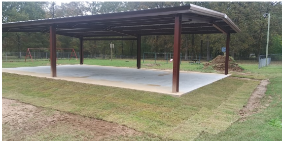
Pavilion from the parking lot showing the sod laid around the slab.