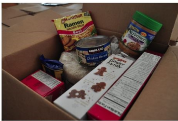
Lexington Ministerial Churches are being challenged to gather 500 non-perishable food items during the month of November for Community Action Partnership of Lexington. If we reach our goal by collecting items in our churches, then Thrivent Financial will be giving a $500 donation to Community Action Partnership. Join us during the month of November to support this effort!

November 1-30, 2020 Lexington Ministerial Churches 500 Non-Perishable Food Challenge Supporting Community Action Partnership of Lexington 931 W. 7th St. Lexington, NE