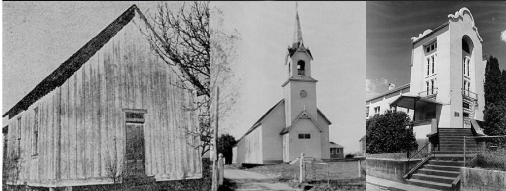
Original Building - 1881