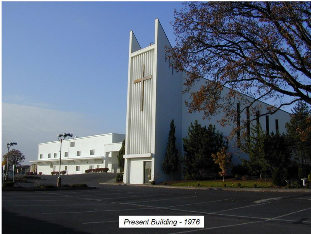
Present Building - 1976