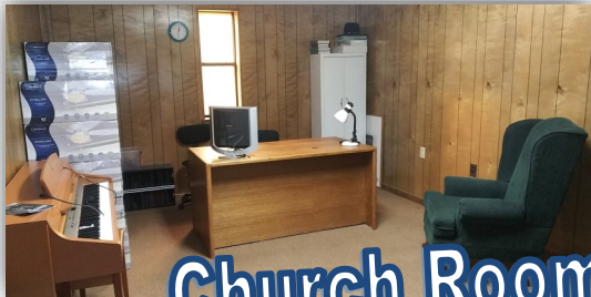
Church Rooms Clean-Up WOW!