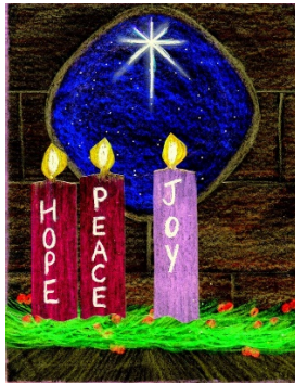
Peace on Earth