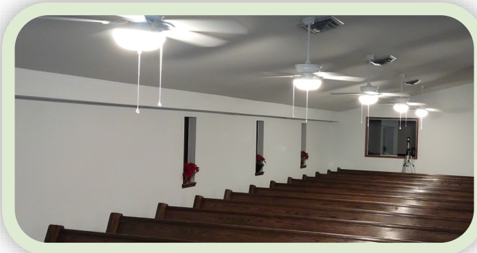
New Ceiling fans have been installed. Work continues to happen!