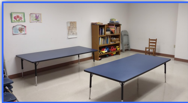
One of the children's classroom—looking good