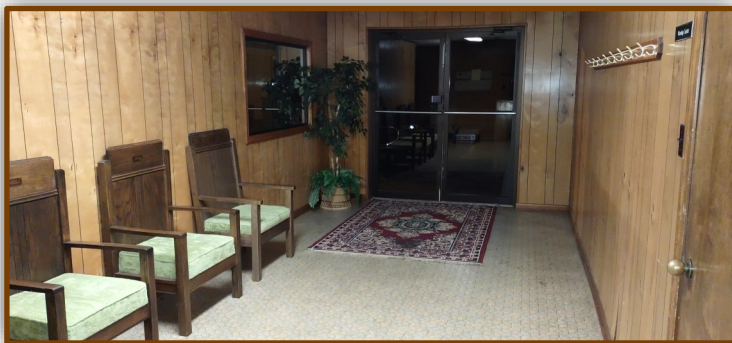
North Wing Foyer (next to church office) Nice