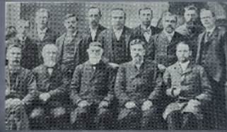
Convention Delegates - the first years

A DEFINING value from the start: Lutheran congregations consisting of confessing believers