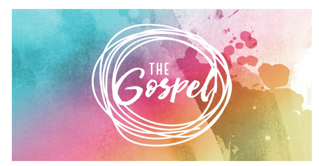
February 14th, 2021

Pt. 7 Compassion — Colossians 3:12, 1 Thessalonians 5:14 Dale Lautzenheiser