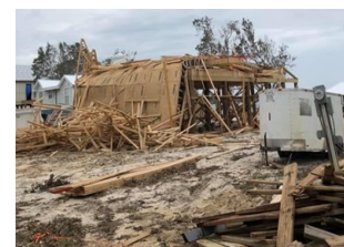
A glimpse of the devastation