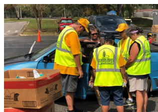
Praying with a victim

"...a total of 1,225 jobs were completed by 768 disaster relief team volunteers, many who served for more than one week (as our ladies did). During the 45-day response, 200+ Gospel presentations made, 52,000+ meals served, and 500+ laundry loads washed. Perhaps the most important statistic recorded was that 28 professions of faith were made."