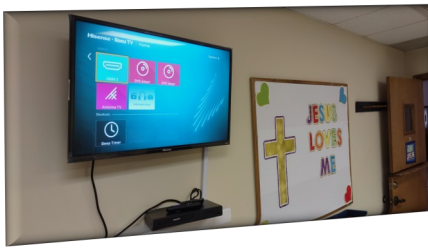
Addition to Nursery