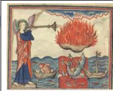
The Fourth Trumpet depicted in the 17th-century painting by Pieter Bruegel the Elder, from the series 'The Fight Between Carnival and Lent'.

Tuesdays, 3:30 – 5 p.m. How does one read and understand this Bible book filled with symbols, imagery and views of the end of time and beyond? Come and find out!