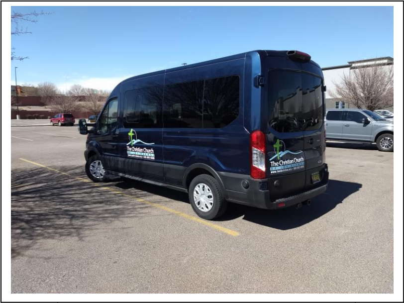
A new look for our church van