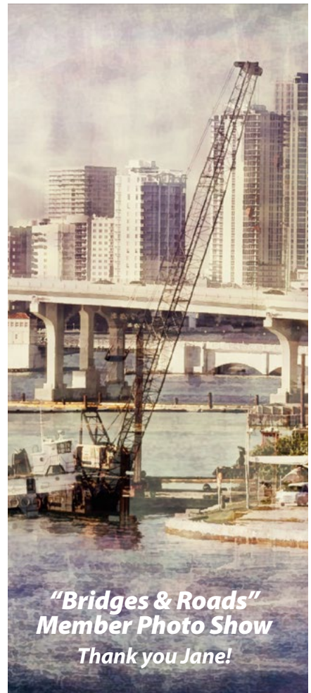
"Bridges & Roads" Member Photo Show