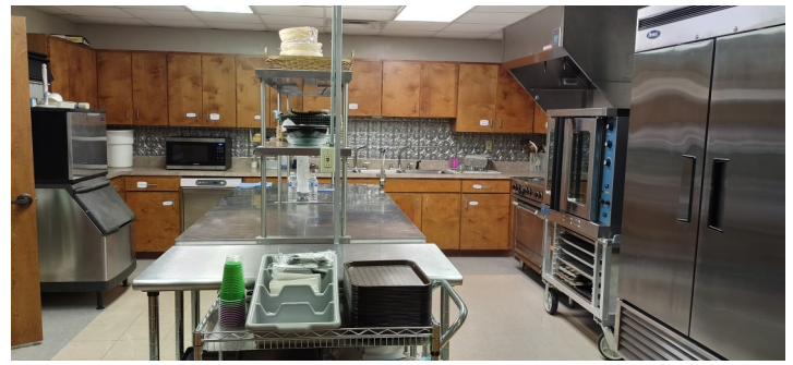
Kitchen (with labeled Cabinets)