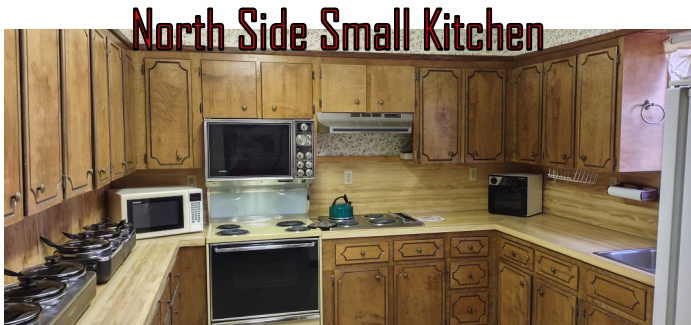
North Side Small Kitchen