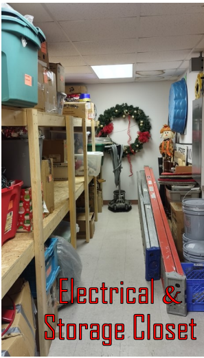
Electrical & Storage Closet