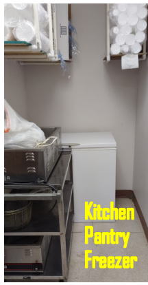
Kitchen Pantry Freezer