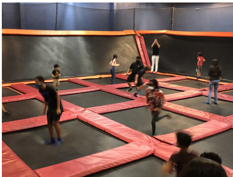
iTrampoline Youth Event!

Text: Download the Remind app and the class code is @mbctribe OR you can text @mbctribe to 81010 to receive updates, reminders, and information on upcoming events.