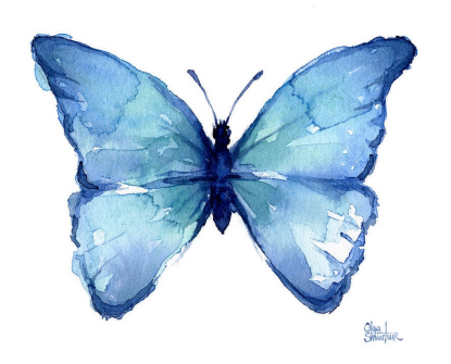
Northern Great Lakes Synodical Women's Organization (SWO)

Next WELCA meeting will be May 10th at 10:00AM in the Fellowship Hall.