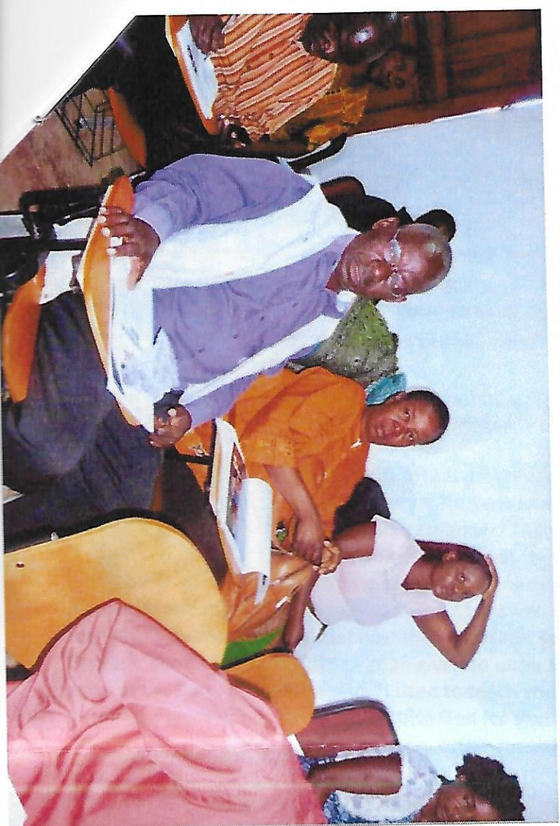
This photo was taken during the Seminar. We were in a class room I was seated with my wife.