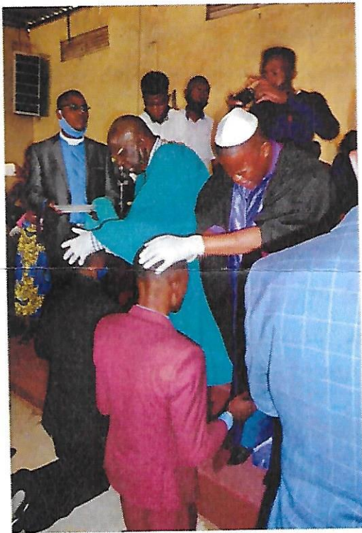
This photo was taken during the ordination of the clergy men