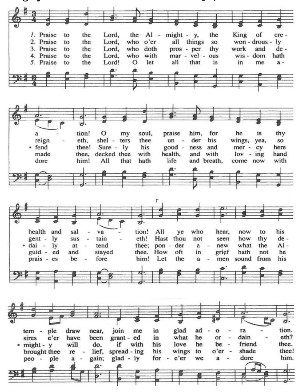
† Opening Hymn #53 "Praise to the Lord, the Almighty"