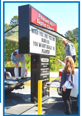
The Changing of the Sign