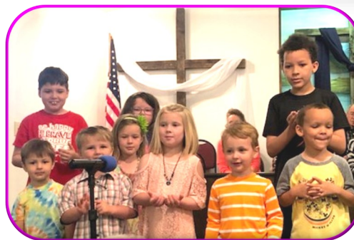
Preschool/Children Church Mother's Day singing performance to Mothers