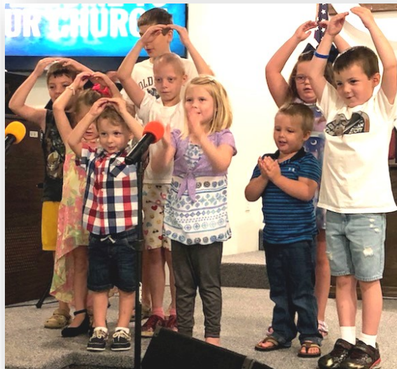
Children singing for Father's Day