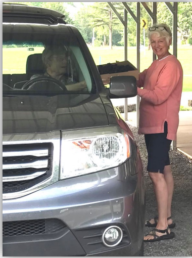
Blackberries were in at Barnhill's Sandy helping a customer