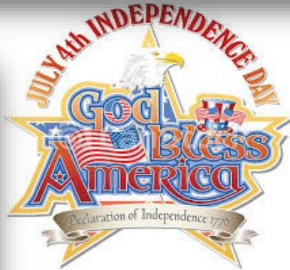
Bulletin Board in Fellowship Hall