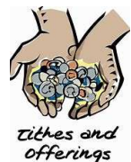
Tithes and offerings

Everything we have comes from God, so let's remember to include him in our plans. We would like to take this opportunity to wish you all an enjoyable and safe summer.