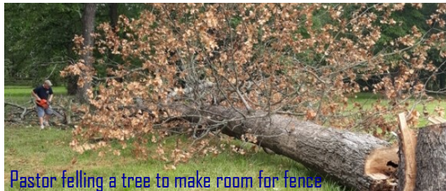
Pastor felling a tree to make room for fence