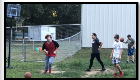
"Back to School Party" part of the activities of shooting hoops.

Pleasant Hill Baptist Church 6470 Hwy 89 S Cabot, AR 72023 Sunday School: 9:30am - Worship Service-10:45am Sunday Evening Worship: 5:00pm Wednesday 6:45pm Wednesday: Children/Youth 6:00pm Meal—Classes 6:30pm www.phbccabot.com facebook.com/pleasanthillbaptistchurchcabot