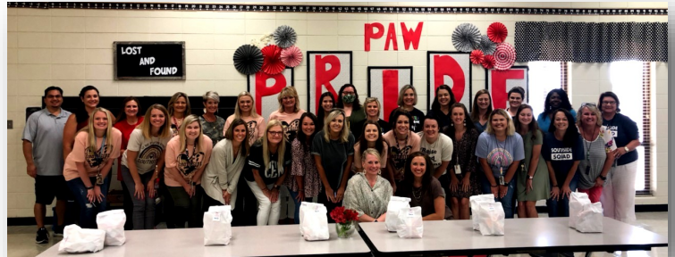
Back to School Luncheon for Southside Elementary Teachers provided by WINGS

see from the past but on God's promises. He will bring us to our promised land.