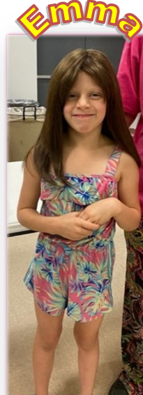
Wearing the wig that was purchased with VBS offering and others' donations.