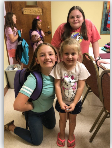
School Supplies and Back Packs given to kids at Back to School Party