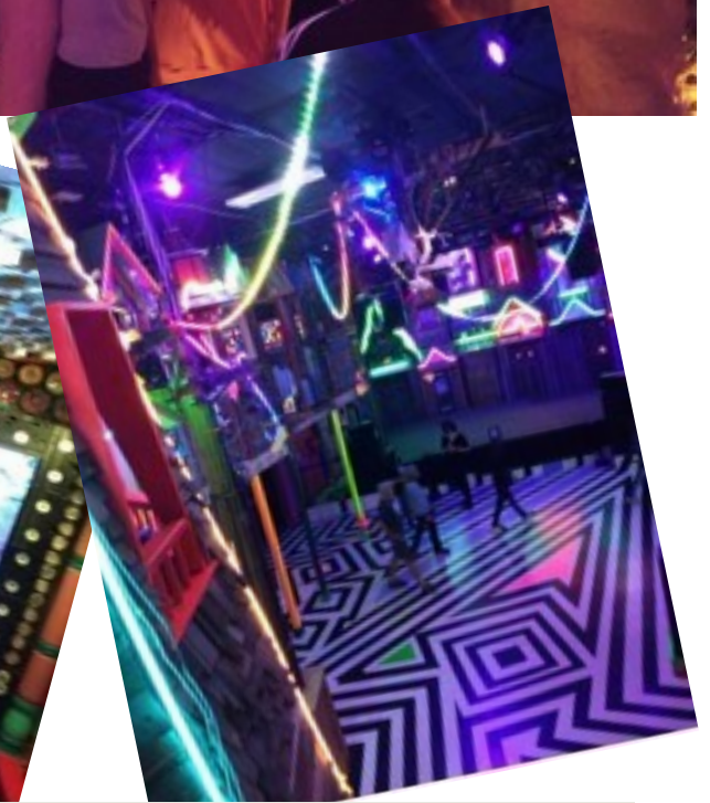
Our visit to Meow Wolf in Santa Fe!