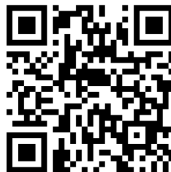
Run Sign up