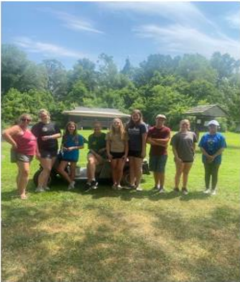
St. Paul's Youth