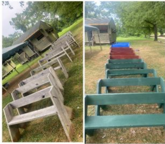
Mission Mondays—Painting benches and picnic tables at Camp Pecometh.