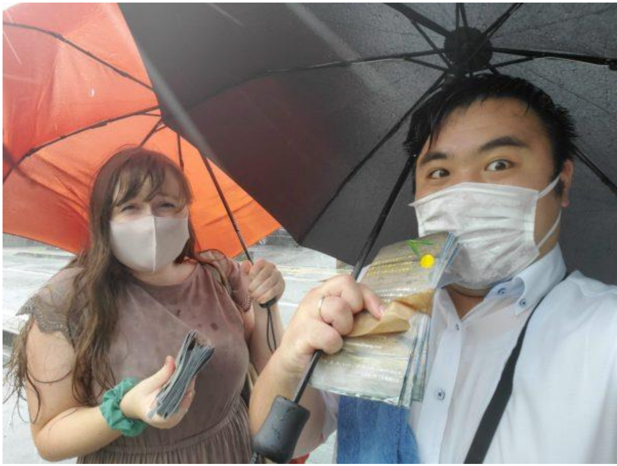
Sudden downpour while out soul winning