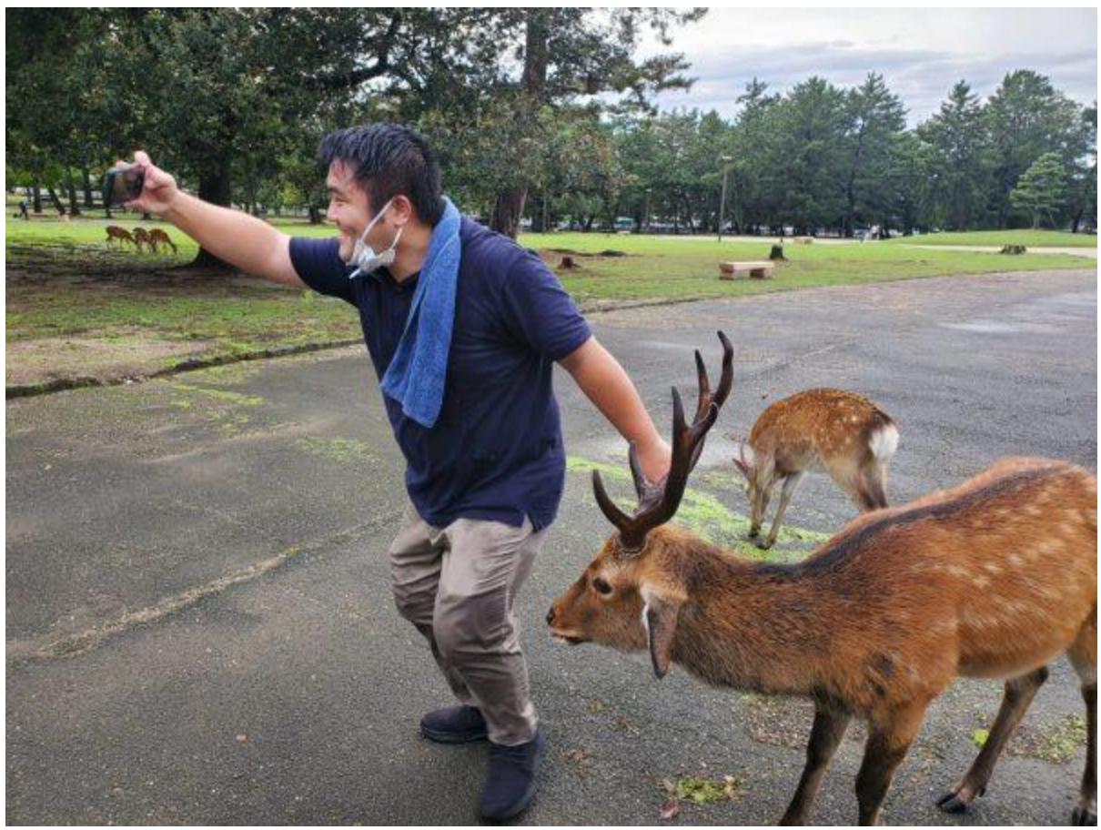
Selfie with a buck