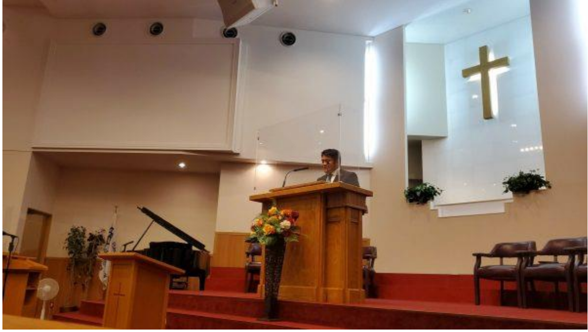
I got to preach for the Ladies' Meeting.