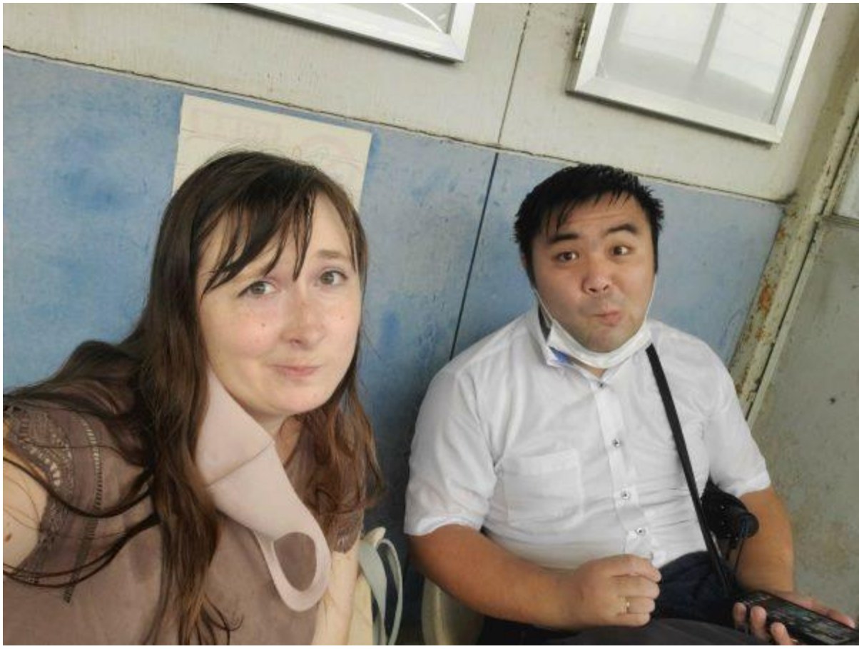
Umbrellas are NOT effective when it is raining sideways!