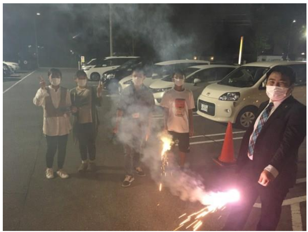
Setting off fireworks with the teens