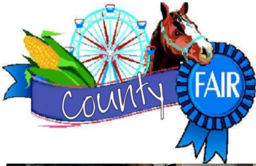
RFUMC Church booth at the Fair