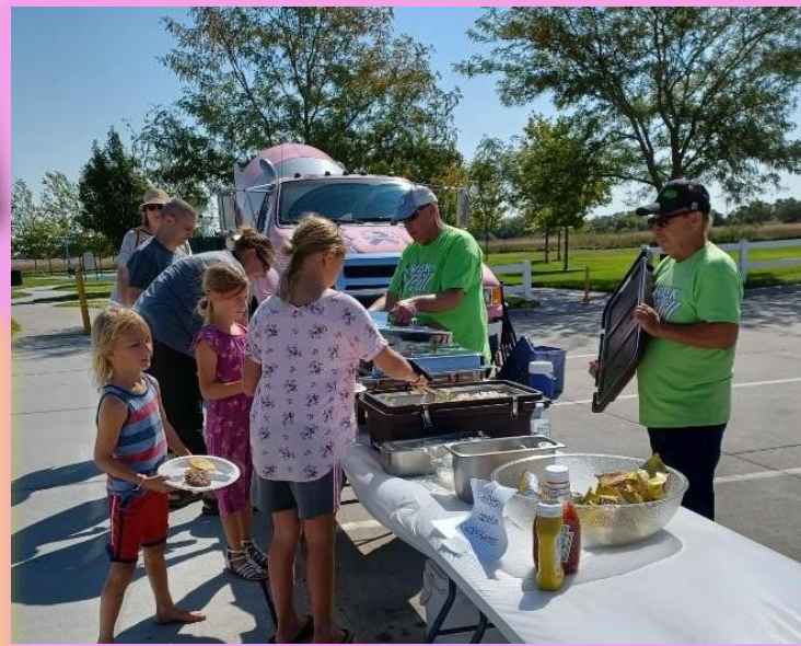
Thank you to Concrete Cares of Nebraska for the $2,500 donation and for helping provide lunch.