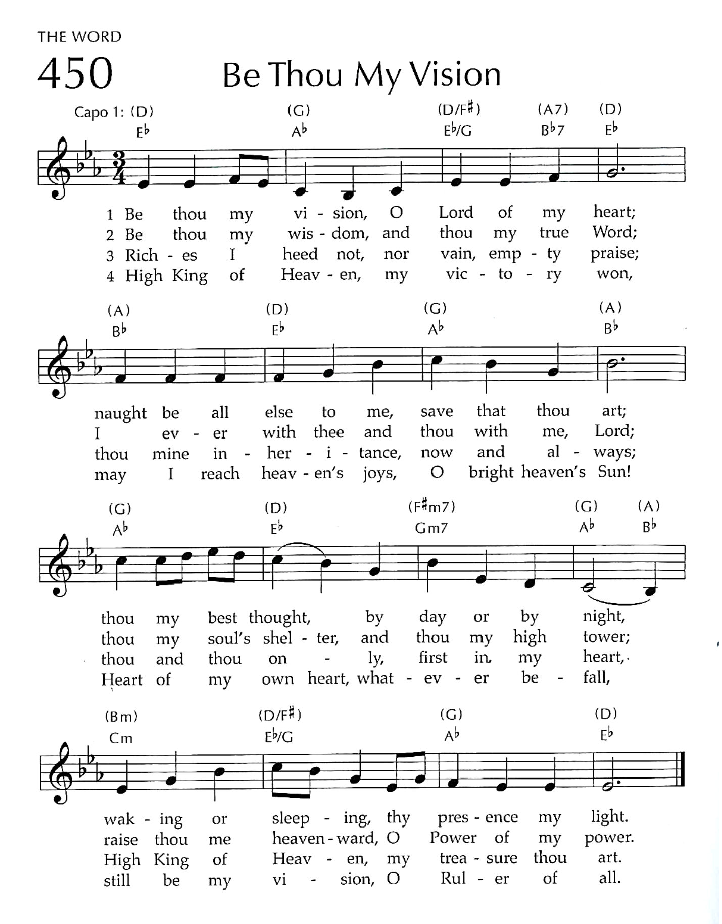
Guitar chords do not correspond with keyboard harmony.