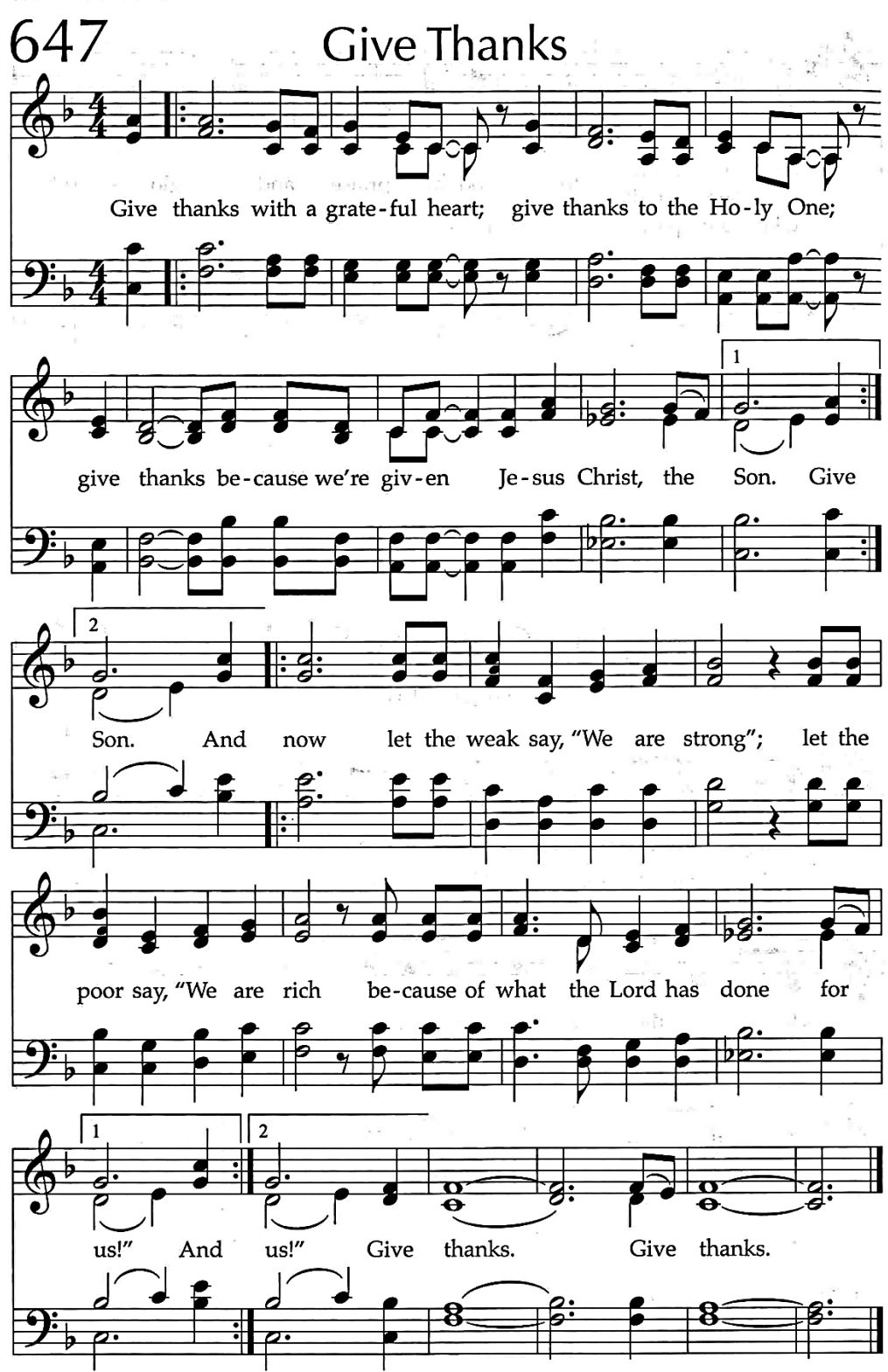
Drawing on language from 2 Corinthians 6:10 and 12:10 as well as Psalm 126:3, this short and repetitive song can be easily memorized. The simple vocabulary makes it suitable for multigenerational use, reminding all ages how gratitude for God's goodness changes our perspective.