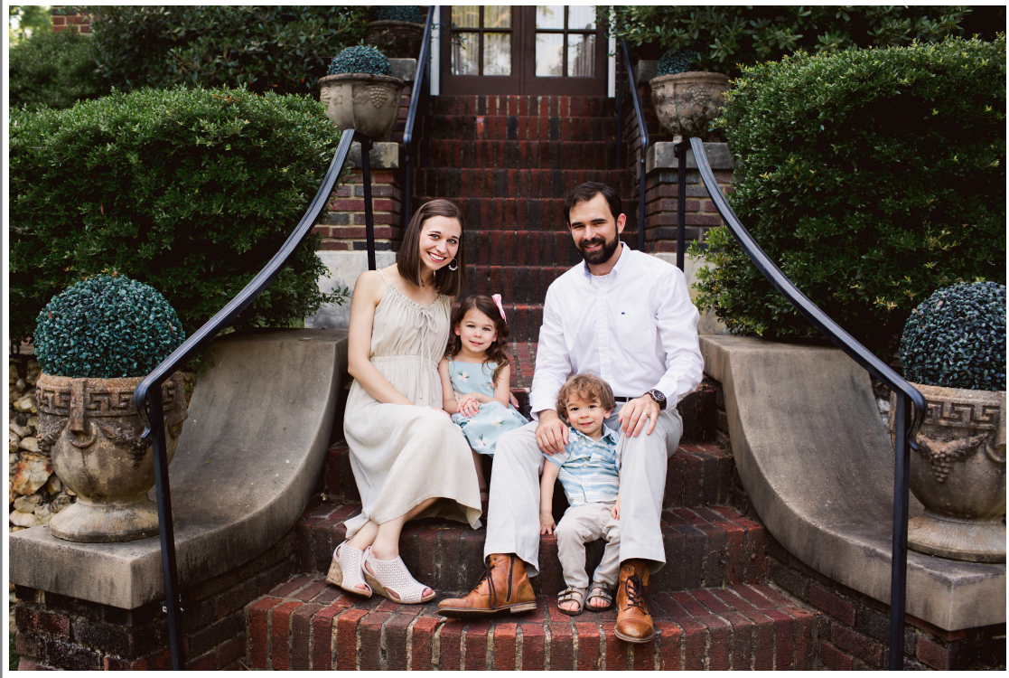
THE CAMPBELL FAMILY (JUNE 2019)