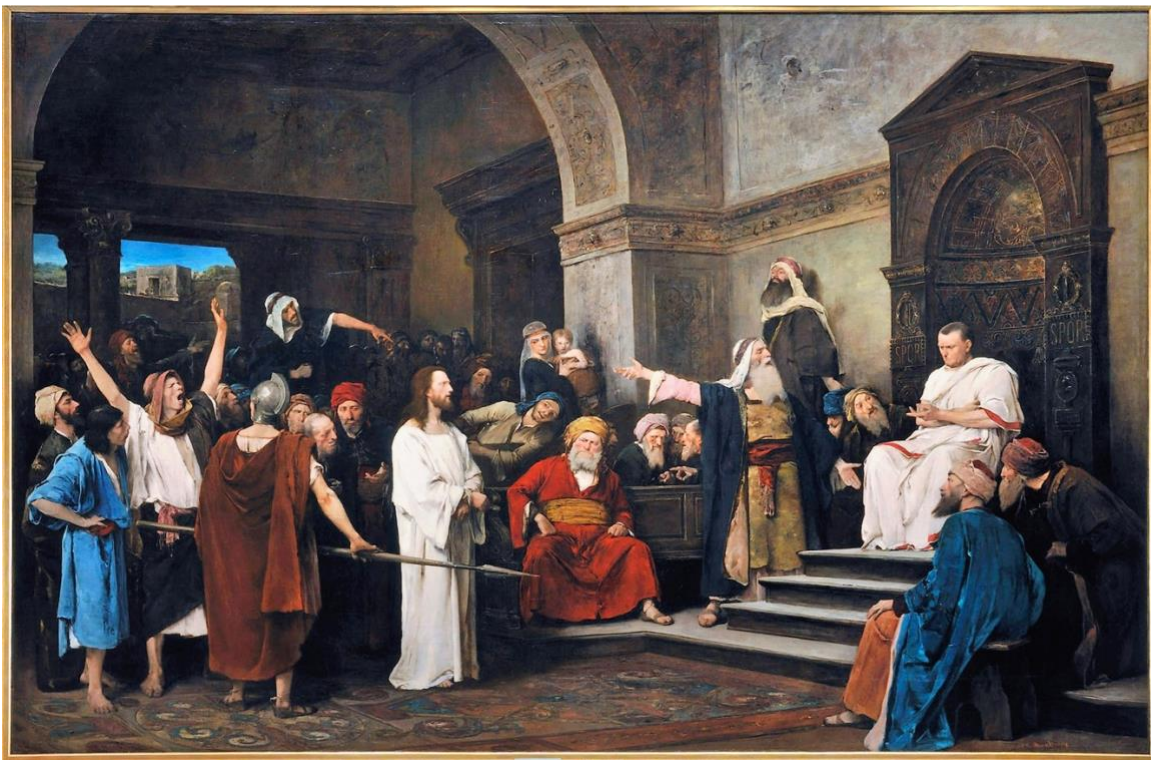
Christ in front of Pilate by Mihaly Munkasy c: 1881

Like us on Facebook - www.facebook.com/FLCgainesville or Follow us on Instagram – www.instagram.com/FLCgainesville Office 352-376-2062 | Email office@flcgainesville.org | www.flcgainesville.org