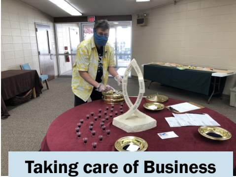
Taking care of Business