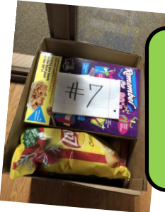
Christmas Give away Gifts