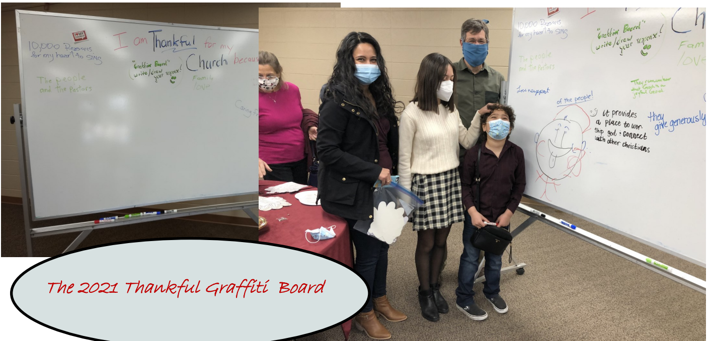
The 2021 Thankful Graffiti Board