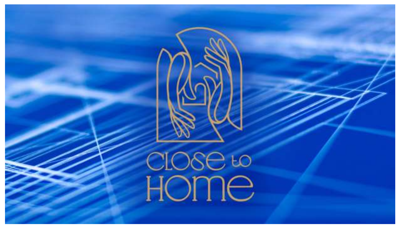
December 12, 2021 – 10:00 AM-Advent Week 3

Covenant is an accepting, welcoming community sharing the glory of God's love with all.