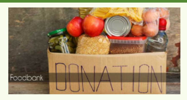
Foodbank - urgent needs before Christmas

Godalming foodbank (at St Mark's Community Centre, Franklyn Road) is appealing for: all types of pasta sauces, including meat based sauces eg bolognaise sauce (but not curry sauces); tins of macaroni cheese, tins of hot dogs and tins of mixed sausages and beans. Also orange squash.