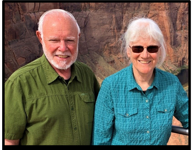
Leading Another Southwest Creation Tour

celebrate Christmas. We are thankful that the light (Jesus) has come into this world! This year, we realize ever more so, that our understanding may fail, and we need to rely on God's daily direction. Things in the world today are constantly being turned upside down. However, now is the time to fully rely on those promises.