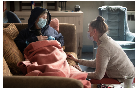
Churches see lots of need this Advent