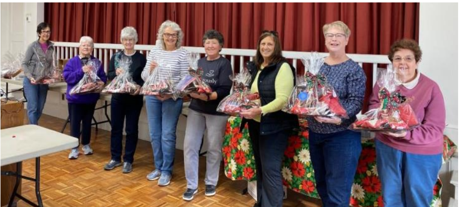
Packing Cookie Kits for the December Food Pantry.