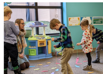
Some of our younger Kids' Worship kids practicing fishing after learning about what Jesus meant by "fishers of men."