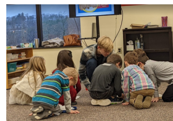
Some of our older Kids' Worship kids diving deeper into scripture to read from the Bible!

Our next Trekkers will be held on February 6, (not the 13 th as originally planned)! Bring a Bible and a friend and come learn how you can be confident that God is always with you, like He was with Shadrach, Meshach, and Abednego.