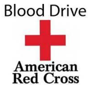
Sarah Auletta ran several blood drives