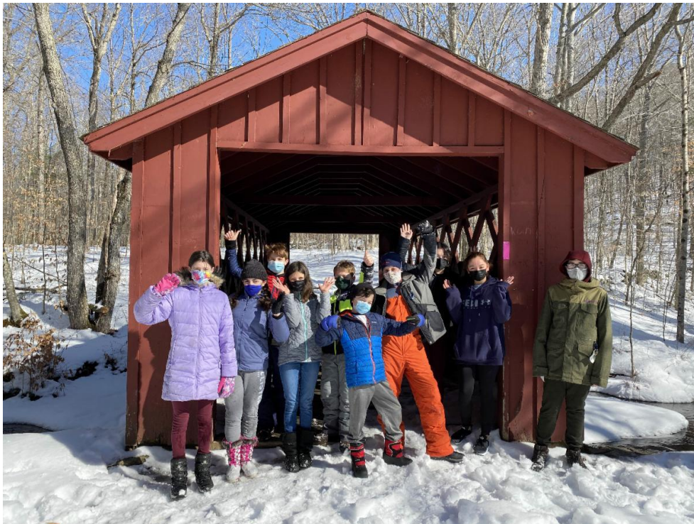
Middle School Youth Group hiked at Chatfield Hollow State Park