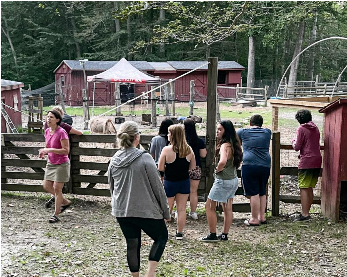
Our youth visited the Bushy Hill Nature Center in Deep River