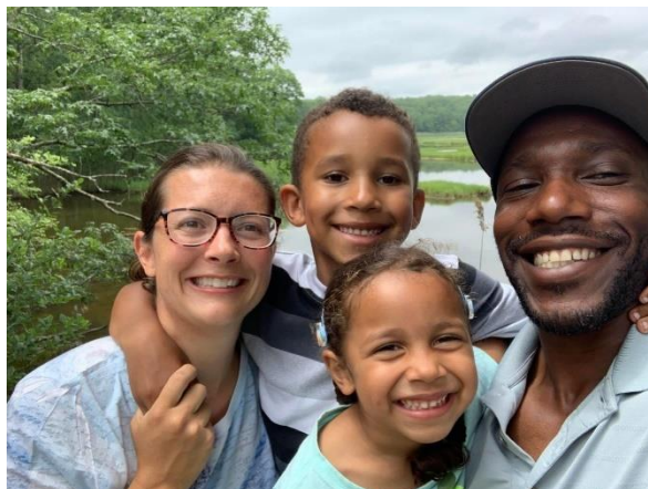
The Asher Family