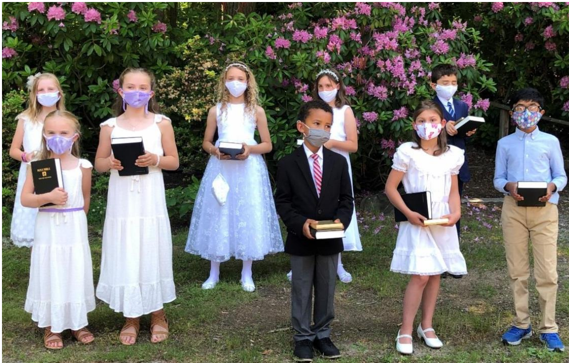
Nine kids after their first Holy Communion