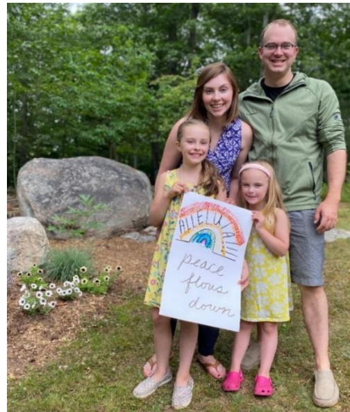
The Dodington Family