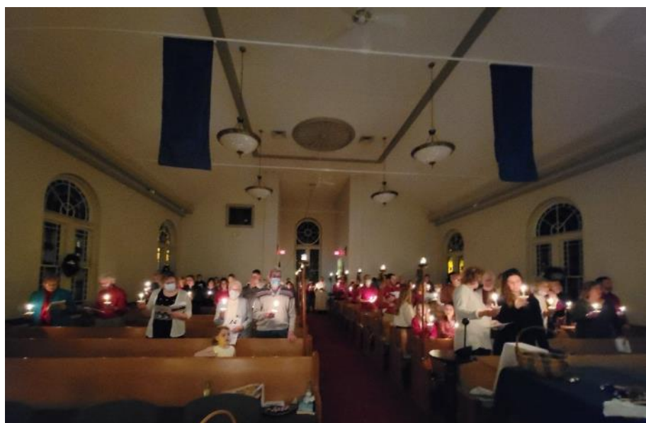
Silent Night singing on Christmas Eve by candlelight.

Ushers on the list and arrange a swap. Please notify the church office of the change.