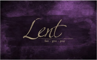
2022 Lenten Lunches Sponsored by Lexington Ministerial Association

Lenten Lunches are hosted by churches in Lexington offering a lunch and devotional service provided by each individual congregation.