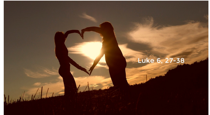
Luke 6, 27-38

Sermon Theme Live with Compassion To prepare for the service Please read: Luke 6: 27-38