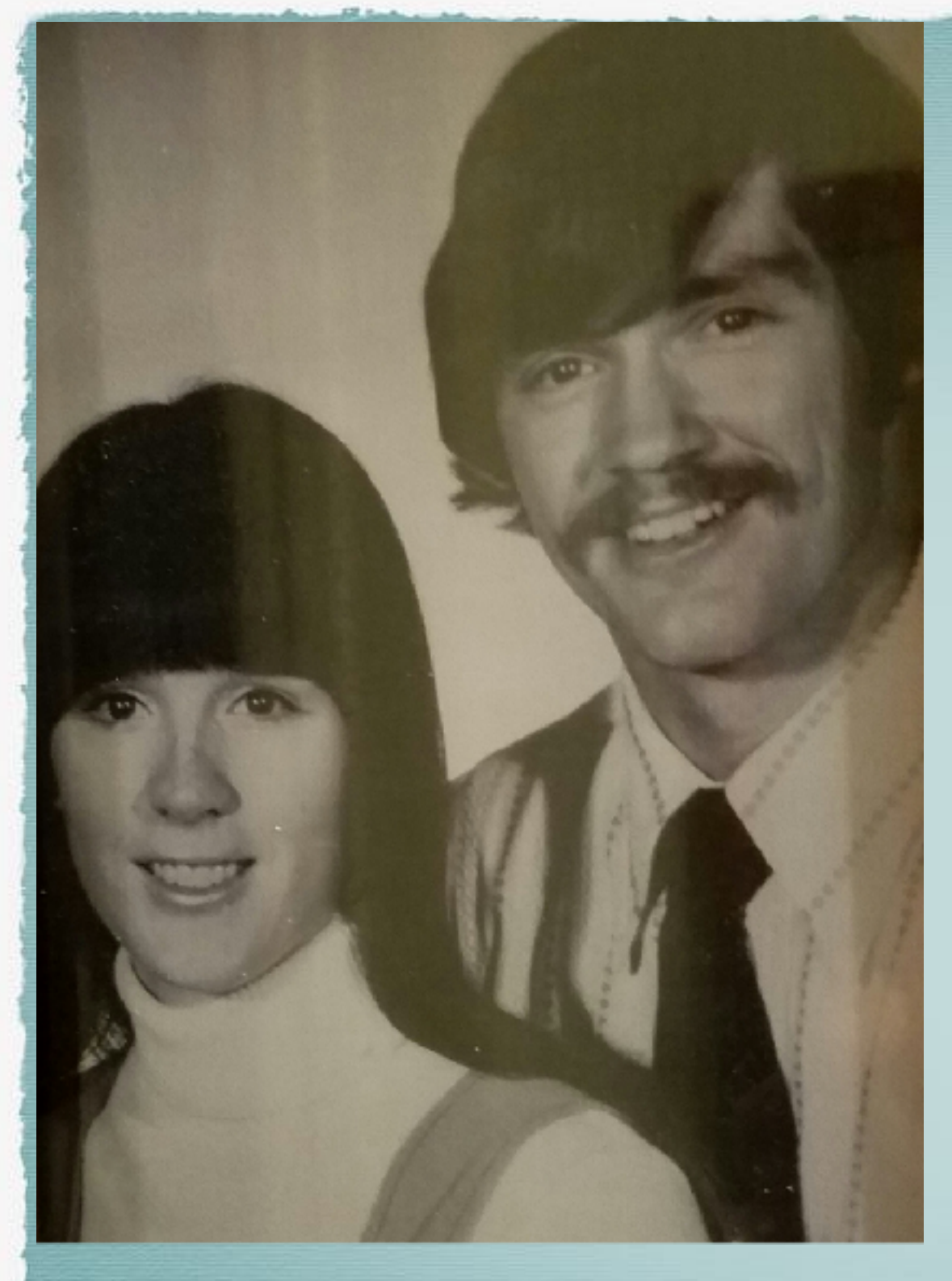
How we started