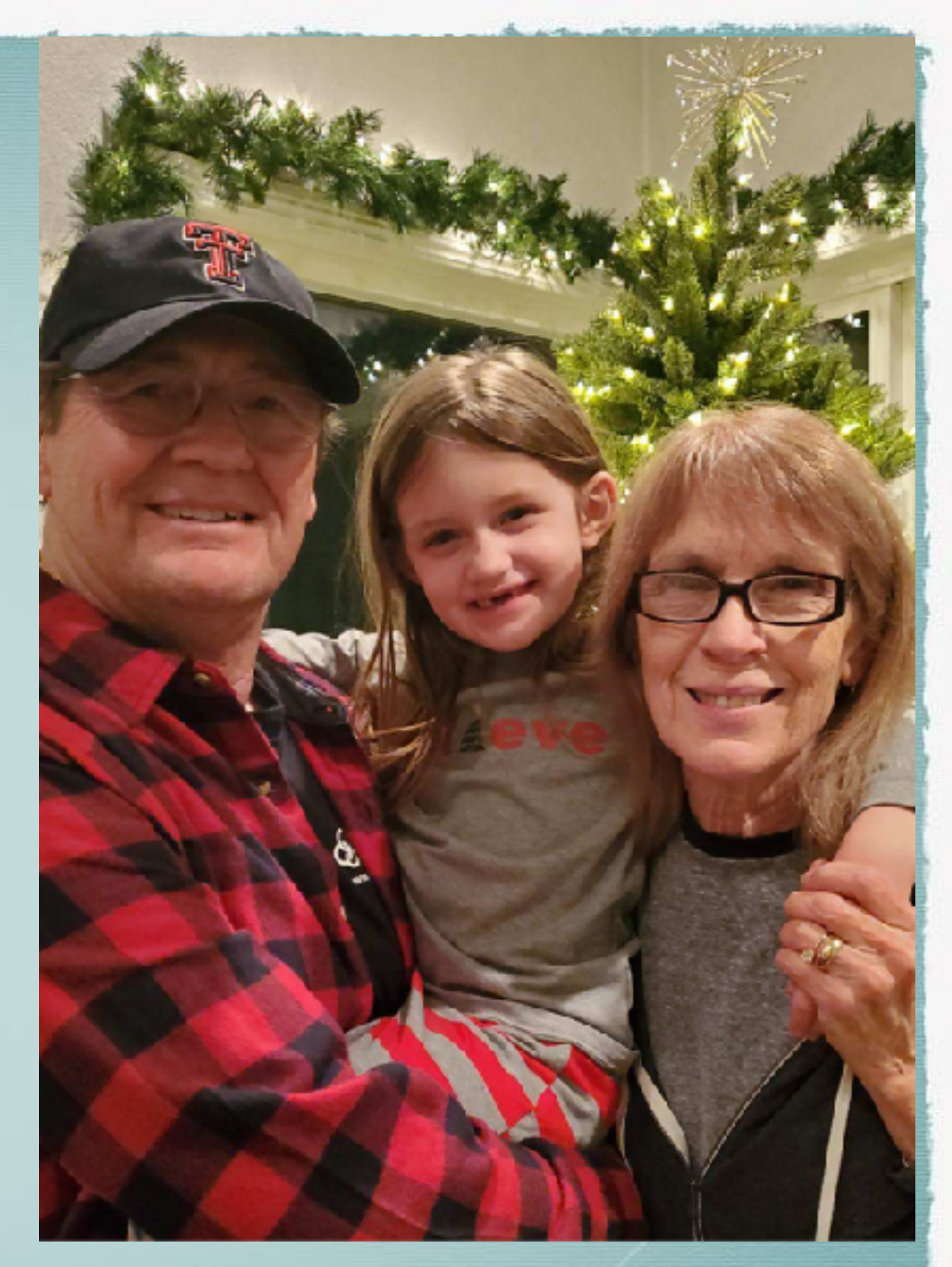
After 51 years